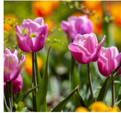
Sustainability Tip of the Month— Spring Gardening